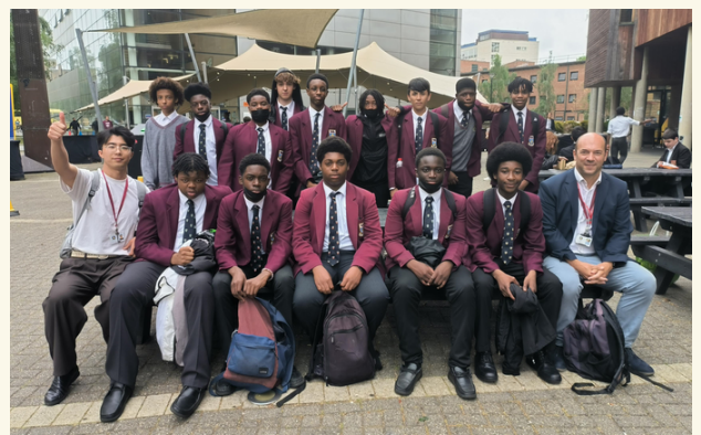
The Year 10 Mandarin boys

Our students were a credit to themselves, their families and the school, and I hope they found the day insightful.