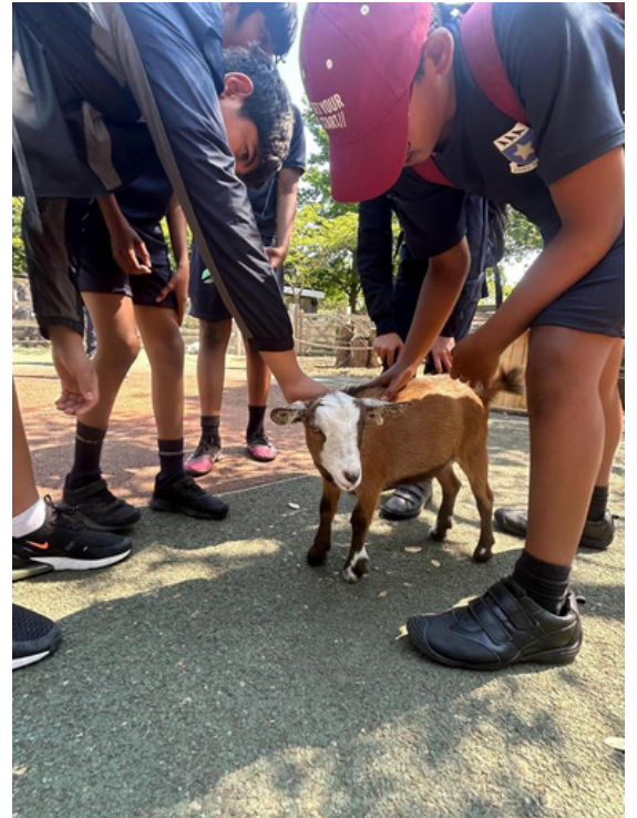
This trip was the G.O.A.T.