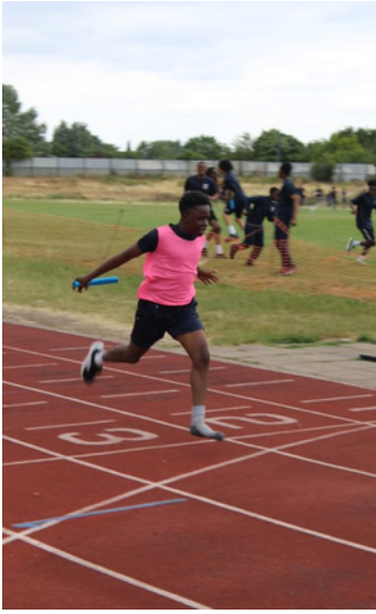
Sprinting for the line