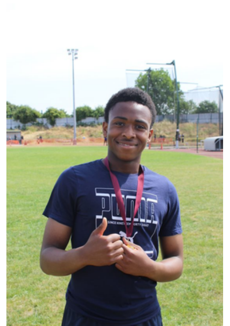
Another Gold medal