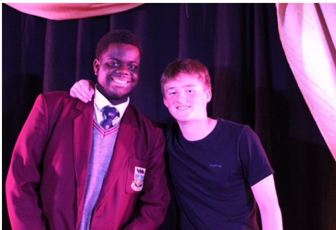
The behind the scenes geniuses

On Wednesday they performed to Year 5 classes from local schools to rave reviews. One child said 'it was the best thing they had ever seen'. Praise indeed. On Thursday parents and teachers finally got to see the production and we can confirm that it was absolutely fantastic! It was incredibly funny with strong performances from the whole cast. We are already looking forward to next year!