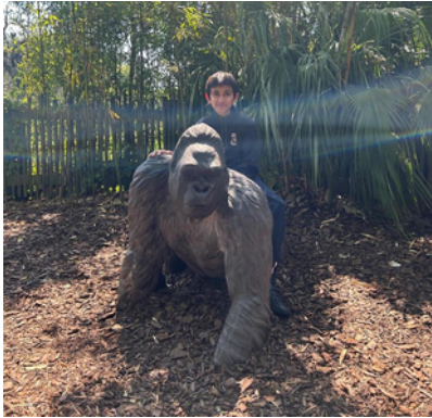
Riding a gorilla

The boys spoke to zookeepers, had a workshop on environmental conservation and generally had fun exploring and seeing all of the animals.