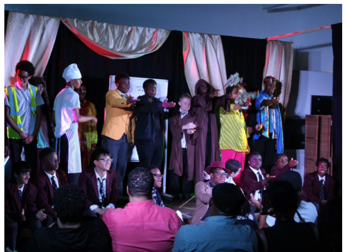
The final number