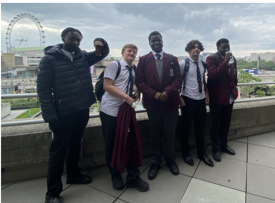
On the National Theatre balcony