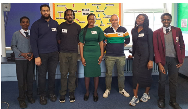
Our impressive alumni