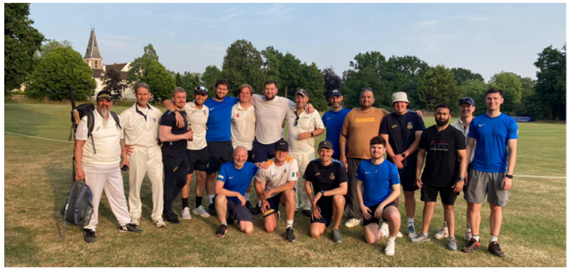
Well done SJC staff