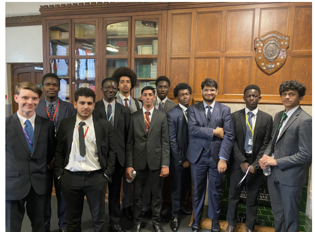
Our SJC delegates