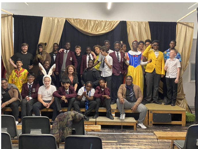
The whole cast