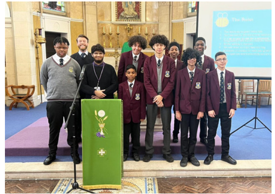
All the winners!