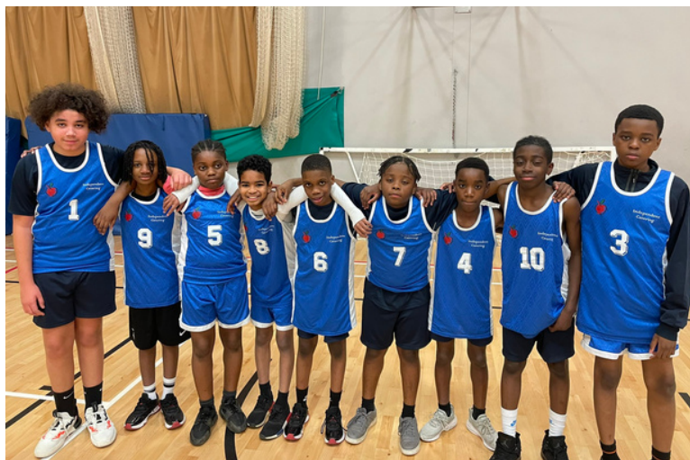
Congratulations on a great performance!

There was just the one fixture this week again due to some untimely cancellations. Our U12s made the short trip to Oasis Shirley Park to face off in basketball. What a tight game this was, our boys started off really well, quickly going 2-0 up. Unfortunately our hosts pegged us back and won the game 7-6. It doesn't get much closer than that. However the main thing was that our boys were smiling throughout and are definitely getting better. Well done boys!