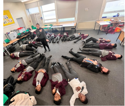
Mindful circle time

Overall, our Wellbeing Day was a great success. Students had the opportunity to learn new skills, take part in fun activities and have a day focused on their happiness. We are very proud of our students for their enthusiasm and commitment to this event. We look forward to our next Wellbeing Day and hope that it will be just as rewarding.