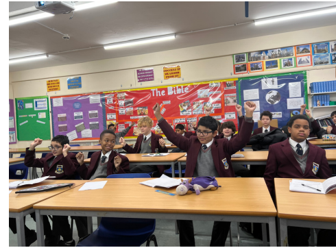
Exercising in class!