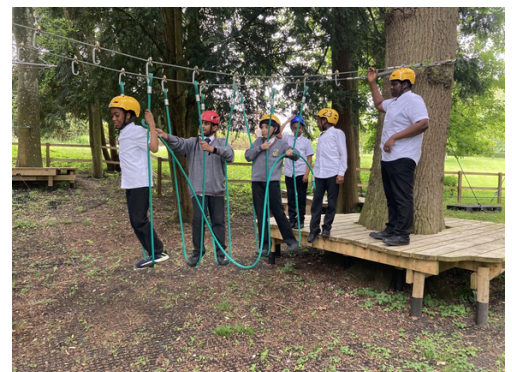
Enjoying the assault course