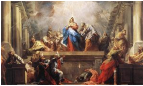
The power of the Pentecost

Pentecost is significant for Catholics (and other Christian denominations) because it commemorates the descent of the Holy Spirit upon the apostles and other early followers of Jesus Christ. The word "Pentecost" itself means "fiftieth" in Greek, indicating that it occurs fifty days after Easter Sunday.