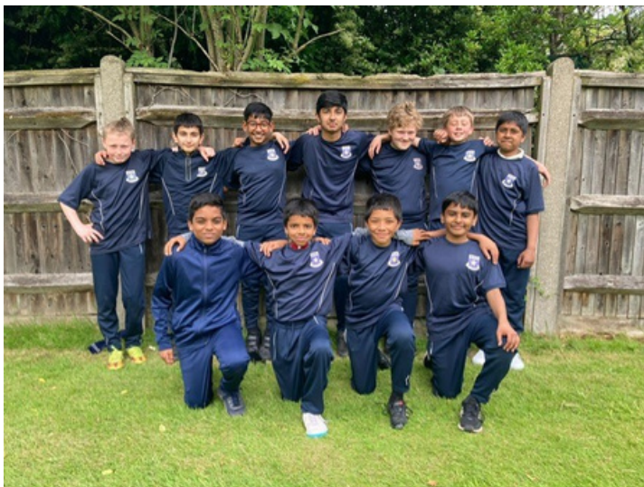
Our new Year 7 Cricket team