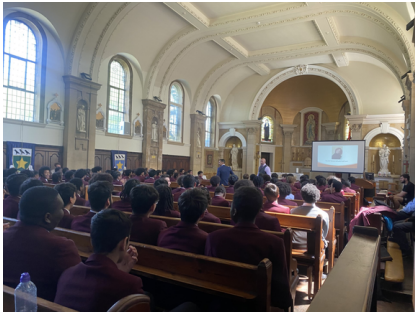
Celebrating our journey

They are in the midst of their GCSE exams but on Wednesday Year 11 had their leaving assembly in the Chapel. It was an emotional and memorable event, the atmosphere was a mix of nostalgia and excitement; teachers shared heartfelt messages, reminiscing about their journey and expressing pride in their many accomplishments over the last five years! We are looking forward to seeing many of you back in Sixth form next year!