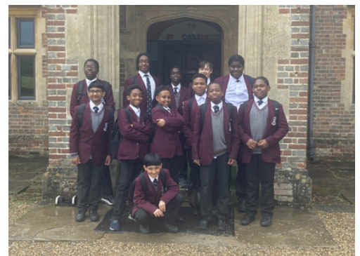
Ready for the retreat!

My favourite part was when we got to work as a team throughout multiple 'parkour' challenges. On the whole I had a fantastic day out!