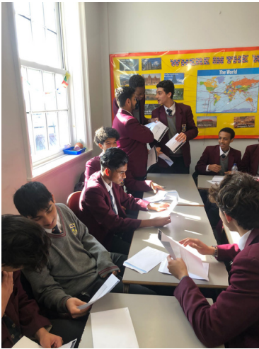
Our excited Year 11s