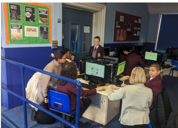
Students working hard at the S4L club

Is your son struggling with homework? There are now two separate clubs to help them out, running every day of the week!