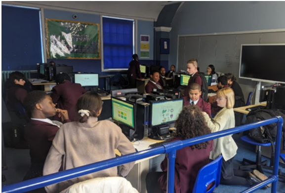
The S4L club runs everyday after school in S22