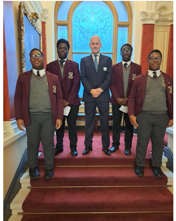
Our aspiring lawyers from Year 10