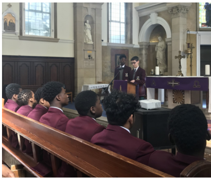
9 Grange delivering their Chapel assembly

These Chapel Assemblies have been fantastic opportunities for students to share important messages from their different faiths and for us all to learn more about the 5 respects of the school.