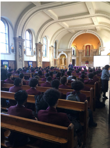
Receiving results in the Chapel

The Year 11s had their results assembly this week, and were excited to receive the results from their recent PPE 2 exams. There was so much to be proud of with many students making good progress from their first set of PPE exams in November to now. The hard work does not stop here, there is plenty to build on for everybody. We are proud of everyone's achievements but a special mention goes to: