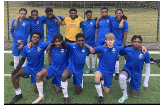
Our unlucky U15s

Wednesday afternoon gave our Chelsea Foundation squad a chance of redemption as they played two games in the AOC league to round off a disruptive season. We won the first game 3-0 against United Colleges, and the second 1-0 against Newham. Well done boys.