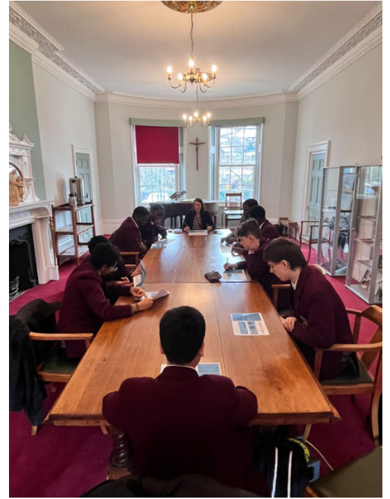
Discussing the school mission statement

Student Council meetings are always a fantastic way for students to propose their ideas for the College. There were lots of discussions about possible community events as well as ways to support different faiths.