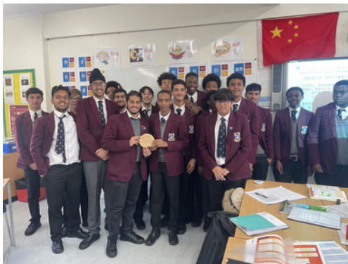
The winning year 11s

The HSK3 language examination is extremely challenging, and they should be incredibly proud of their achievements. Well done!