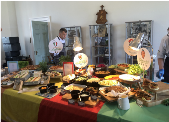
A great range of options