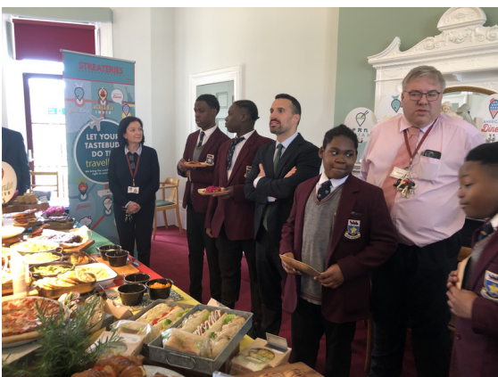
Judging the food

Over the past few months, the College has been exploring a variety of Catering companies with the potential of having new caterers in place for September 2023.