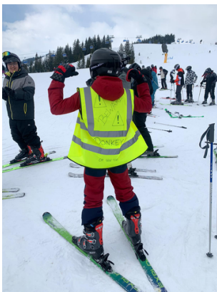
The Donkey of the day!

Evenings were spent playing table tennis at the youth hostel and generally just recuperating after a tiring day on the slopes, but a particular highlight was the dinner at the pizza restaurant where the boys continued their impeccable behaviour.