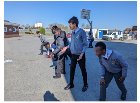
On your marks...

This is the formula that the students used in class. Try calculating your running speed at home!