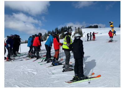
Learning the basics