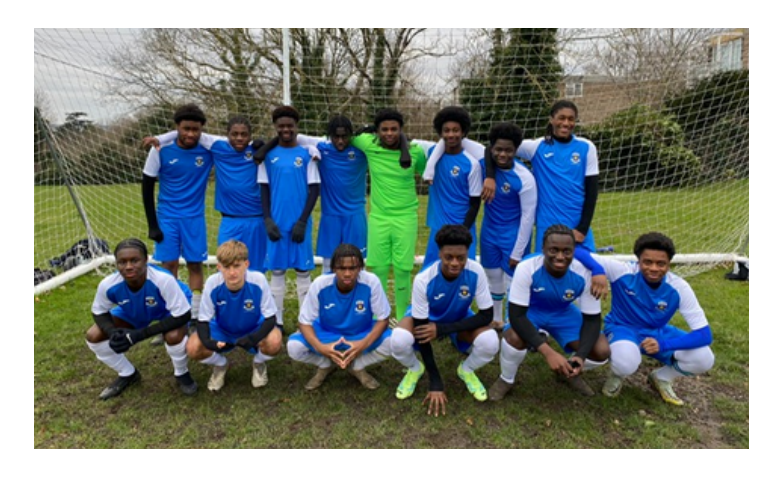
Looking sharp in the new kits