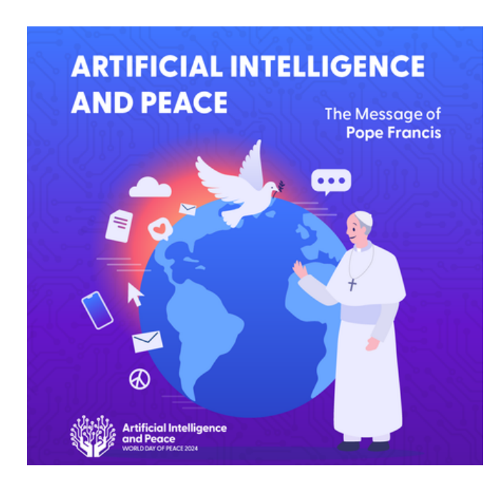
The message of Pope Francis

The developments in AI are being taken very seriously by world leaders, many huge benefits for humanity can be seen, but also so can many dangers. Pope Francis had shared the following with us: