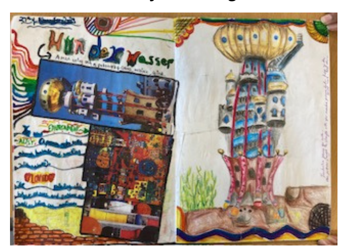
Well done Year 8!