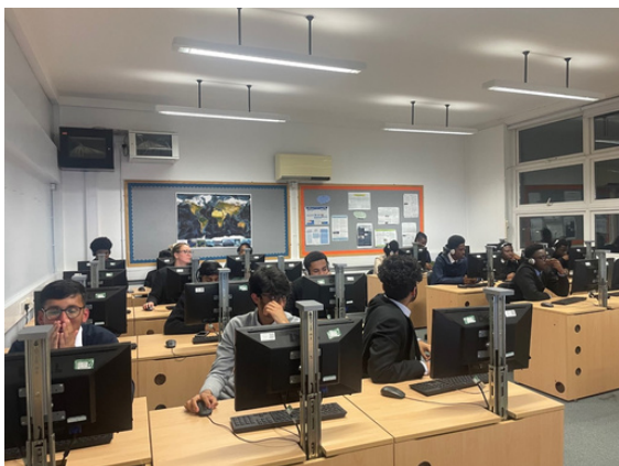
The trading floor