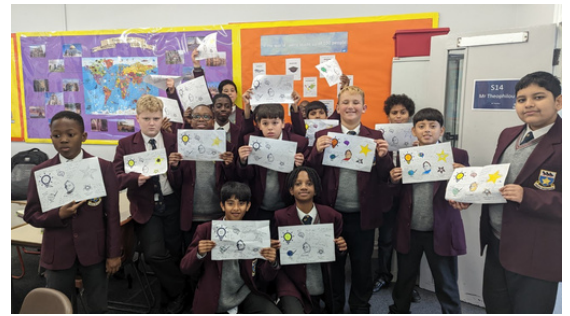
Students with their Lasallian displays

Please follow the SJC Chaplaincy & RE Twitter page for more information and photos: @SJCchaplain