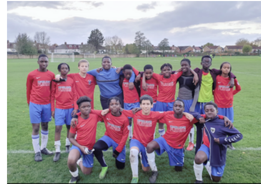
The winning Year 8s