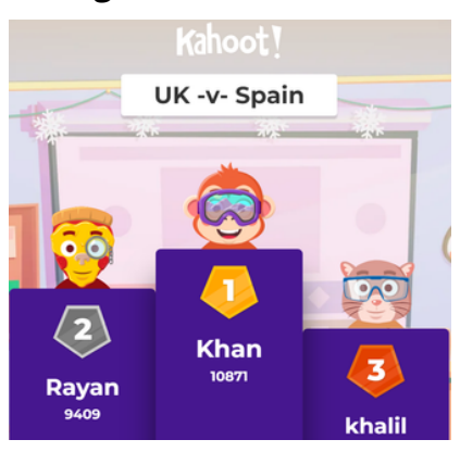
The winning podium