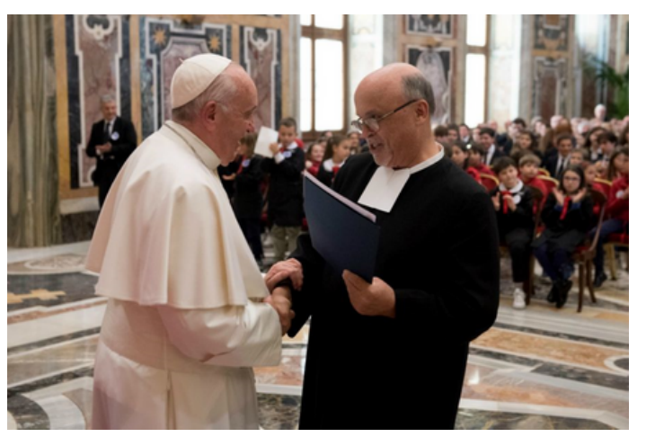
Pope Francis with a Lasallian Brother

The De La Salle Brothers, also known as the Christian Brothers or Lasallian Brothers, continue to be an international religious congregation dedicated to education. They follow the teachings and mission of St. John Baptiste de La Salle. Today, the Brothers operate schools, colleges, and universities around the world, providing education to students of all backgrounds, particularly those who are economically disadvantaged.