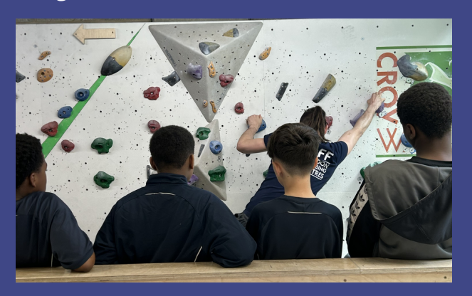
Learning how it is done

Yesterday some of our top House point achievers in Year 8 enjoyed a trip to the Croywall climbing centre in Croydon! The boys had a fantastic time seeing who could climb the highest!