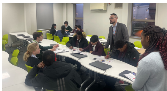
Using digital software