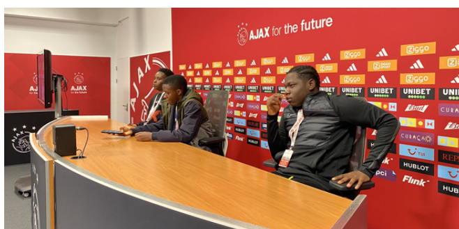
Facing the press