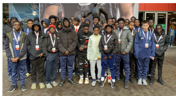
Outside the Cruyff Arena