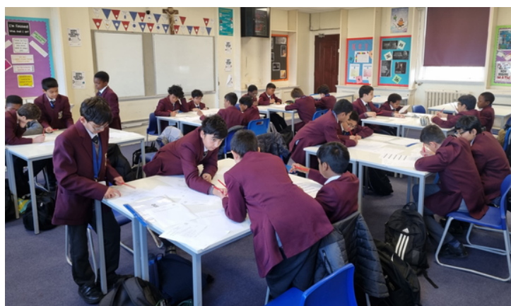
Hard at work