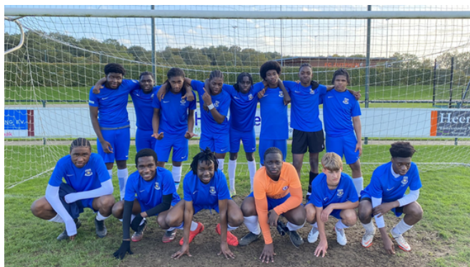
The winning team