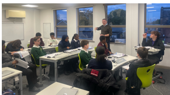
Learning about the Metaverse

This week Year 9 and 10 students headed to Alleyn's School in Dulwich to take part in their Digital Academy.