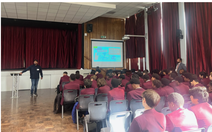
An inspiring speech

Prior to the half term break, we hosted St Giles Trust at our college, where they presented an informative assembly for our Year 9 and 10 students.