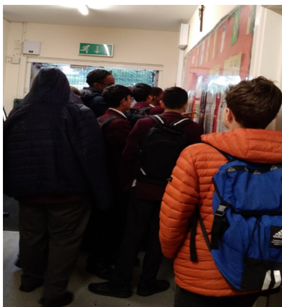
Finding out this week's riddle