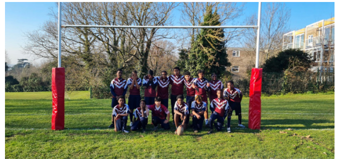
Well done U14s on a great performance

Our U14s played their first game of term 2 against a strong Kingsdale. Our performance was much improved on the last time we played them but unfortunately we lost 30-15. Well done lads!