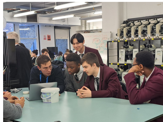
Excited Year 11 Students

Thank you to our partners at Association for Black and Minority Ethnic Engineers for organising this incredible workshop for us.