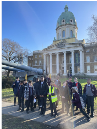
A great day out!