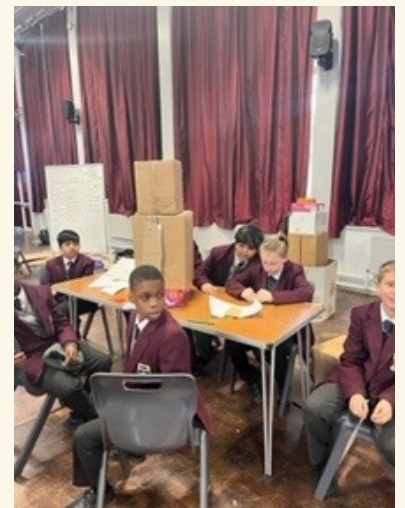
Raising money for a great cause

On Friday the 3rd February, a group of Year 13 students hosted a games afternoon as part of their Social Enterprise assessment. Year 7 students took part in a series of games including, spelling bee and 'build a robot' designed to raise money for the African Caribbean Leukaemia Trust. The group of Year 13 students raised £70 in total!