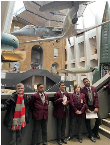
Loving the scarf