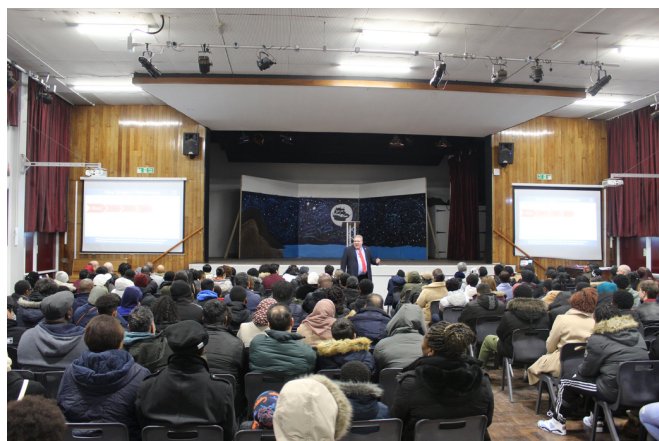
A full house for the information evening