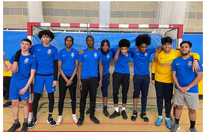
The Year 11 Handball team

Our Handball campaign was kicked off by our U16s, who travelled to Carshalton. It was a tough night against the best team in the borough, but our boys defended immensely to keep the score down, and score some good goals ourselves. 12-5 was the final score, well done boys for your great effort!