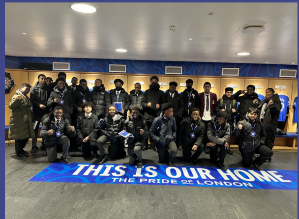
Blue is the colour...