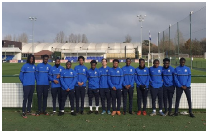
Our Year 12s at Cobham

There was only one fixture this week due to 2 cancellations. The U16S made the 4 hour round trip to Luton to face off in the 4th round of the ESFA cup. We started the game positively, going 2-1 with around 8 minutes to go. But unfortunately we lost 3-2. It was an incredible achievement to get this far in the competition so well done to everyone who participated.