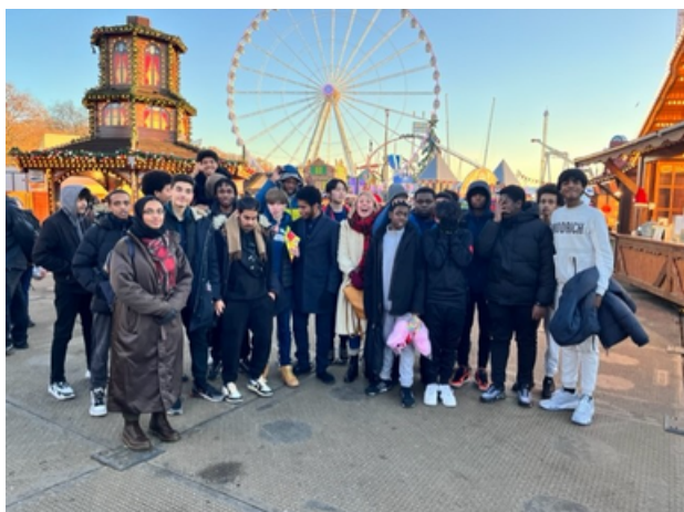
Truly a winter wonderland

Year 11 had a wonderful time on their rewards trip on Thursday. They were brilliantly behaved the entire time. Most were new to ice skating but everyone gave it a go - with varying degrees of success! Most importantly they looked after each other, and were a credit to the school. Overall, it was a memorable and enjoyable trip for the students, who left feeling festive and in the holiday spirit.