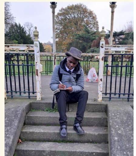
One of our aspiring lawyers

The aim of the programme is to improve students' confidence in corporate environments and their employability skills so our students gave their presentations and had one to one interviews with senior lawyers. Thank you to Proud Places and Jones Day for this fantastic opportunity.