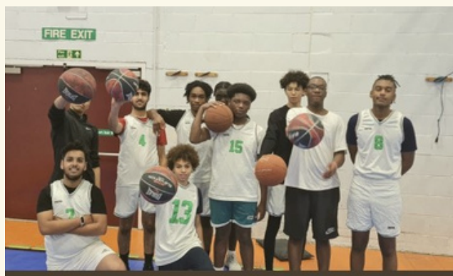
The winning U16s

Well done to the U16 basketball team who this week romped to a 40-19 win over Archbishop Tenison's. Well done boys. Keep this winning record up!