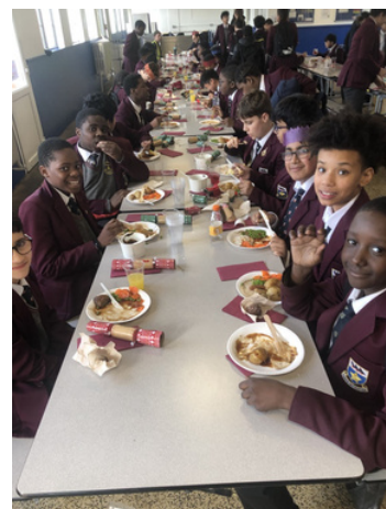
Having a cracking time