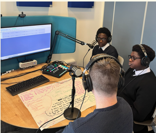
Watch out Joe Rogan