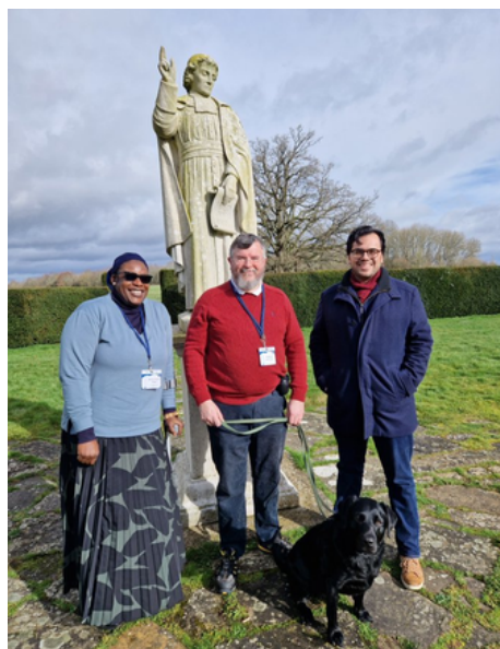
A spiritual retreat