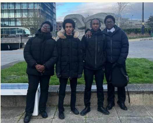
We love Milton Keynes