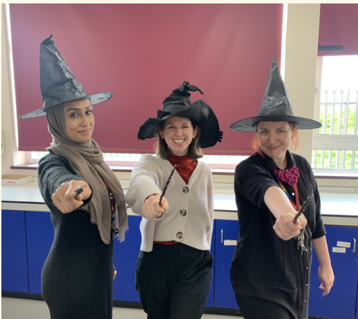
The potions teachers