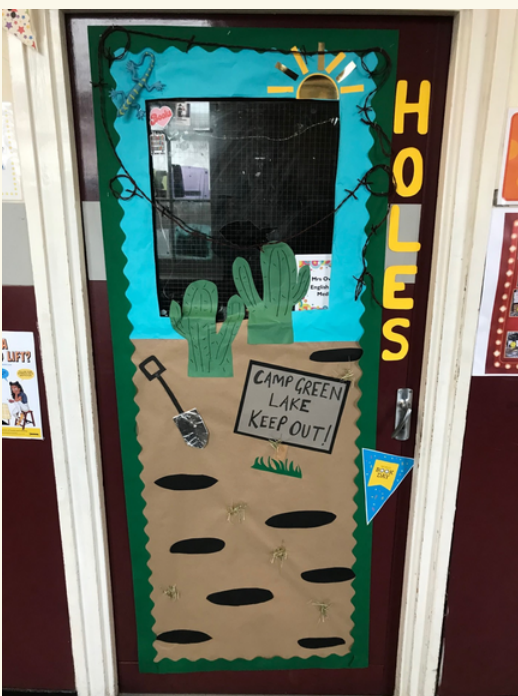
This ain't a girl scout camp...

Thursday 7th March was World Book Day and the whole College was celebrating! Doors were decorated, favourite books were shared and staff all dressed up as classic characters from literature.