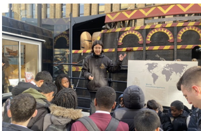
The guided tour