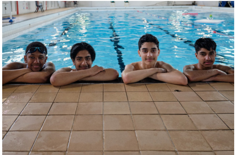
Ready for the Swimming Gala

Next week, we hold our annual swimming gala. Please remind students to be aware of what day they are competing and to bring appropriate swimwear. If pupils have P.E at the same time as their year groups swimming gala, they will be able to watch from the seating area!