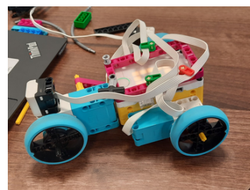
A finished robot