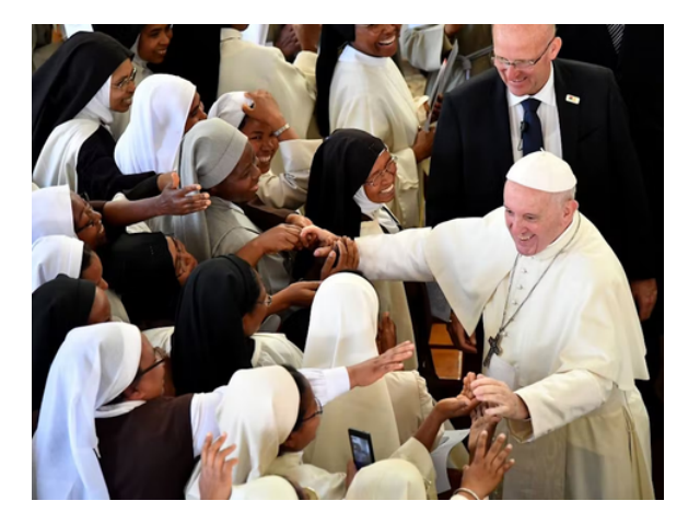
The Pope greeting Christians

We continue to pray for the students of our brother school as well as for all people in South Sudan. Feel free to follow them on their Facebook page. We pray that this ecumenical journey can renew the peoples call for human fraternity, peace and living together.