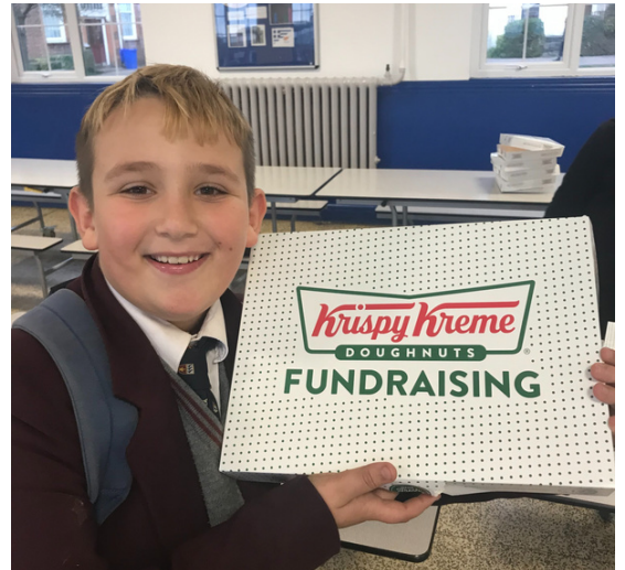
A happy customer at our PTA doughnut sale!