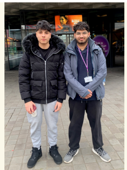
Outside the National