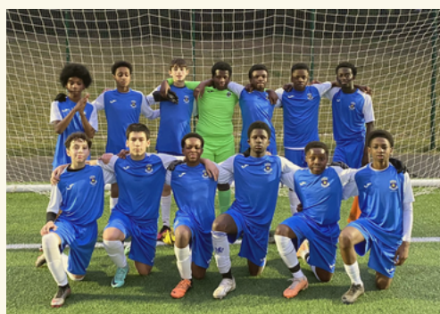
A great win

In the Year 8 game there was an unsavoury incident. I'm happy to report that our students did the right thing and I fully expect all students representing the college to act in a manner that not only shows respect for the college, but also respect for themselves. We should be gracious in winning, as well as in defeat.