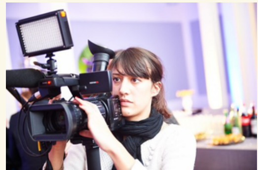
Exciting news for creatives

https://www.standard.co.uk/news/london/creative-industry-jobs-london-economy-city-hall-report-b1118830.html