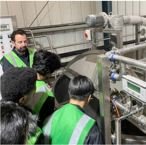
Inside the factory