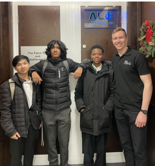
Learning health and safety