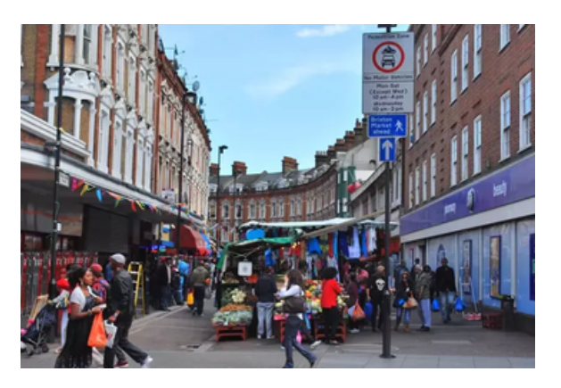
Poems about our busy streets