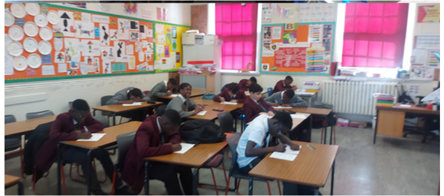
Students studying hard

As part of our continued drive to develop our curriculum so that it is diverse and challenging, we have been preparing a selection of our KS3 higher ability pupils for their mini-GCSE external exams coming up at the start of May.