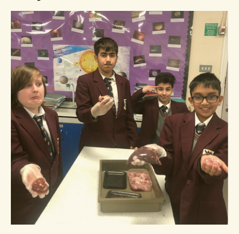
Fun with organs

This week our KS3 classes have been learning all about organs in their Biology lessons! It was fascinating dissecting them and finding out how they worked.